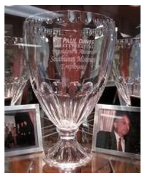
The presidential award won by local Paul Davis employees.